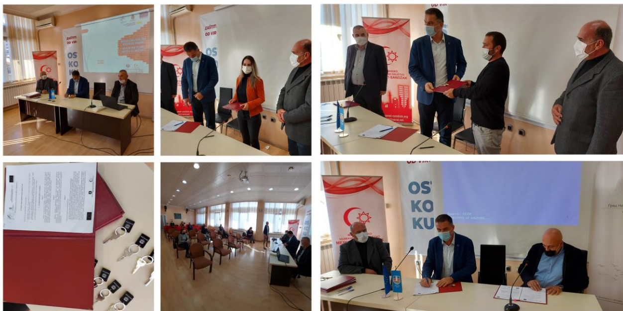
Handover of houses – delivering contacts and keys of the houses

The construction of the houses was finished on 1 st of November. Handing over houses was organized on 9 th of November, in a single event which was also a final project activity. The contracts and keys of the houses were handed over to beneficiaries by the City major and speakers of the event were project manager and representatives of the project partners. Since the pandemic restrictions related to gathering forbid was ongoing, the event was modestly followed so the stakeholders could join the event successively. The event was followed up by media.