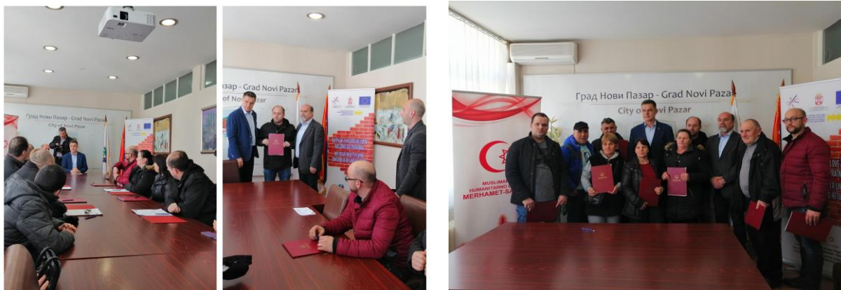
Signing the contracts for support in building materials packages